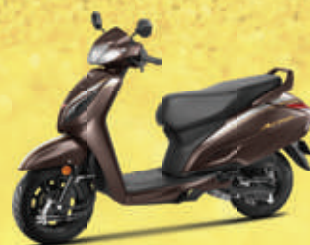
MATTE MATURE BROWN METALLIC

*The technical specifications and design of the vehicle may vary according to the requirements and conditions without any notice • Activa 6G meets Bharat Stage VI norms • Product shown in the picture may vary from actual product available in the market • Accessories shown in the picture are not part of standard equipment • The technical specifications mentioned are for Deluxe variant • *Mileage has increased by 10% for Activa 6G BS-VI Deluxe variant as compared to the Activa 5G BS-IV Deluxe variant • All features may not be part of all variants • **Conditions apply.